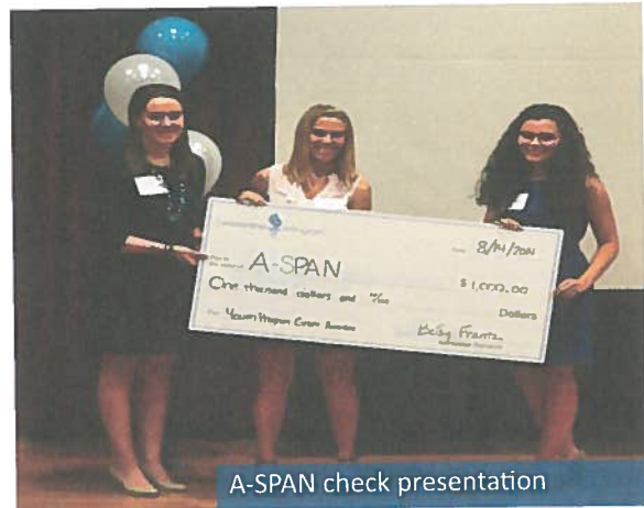
A-SPAN check presentation

Participants are tasked with choosing one nonprofit to be the recipient of a $1,000 grant. They develop their own criteria for evaluating each nonprofit and come to consensus about the grant awardee.